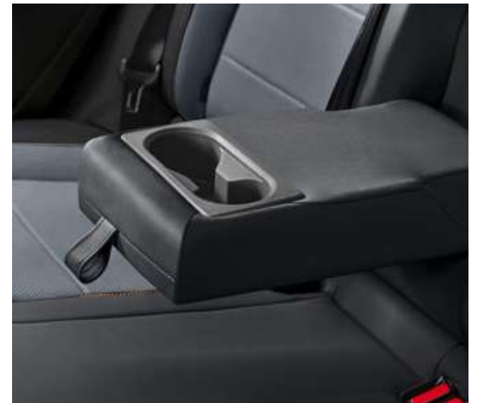
Cupholders In Armrest