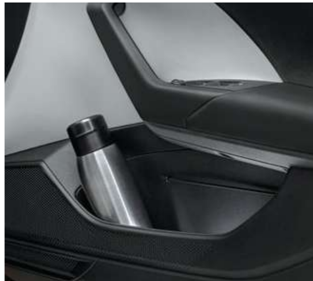
Storage In the Front and Rear Doors