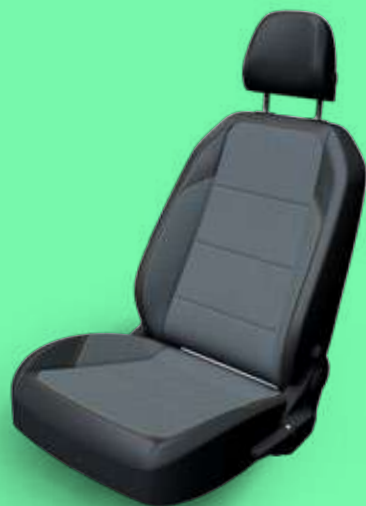
Style Black leatherette front and rear seats with perforated grey designs.