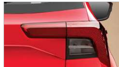
» LED Tail Lamps