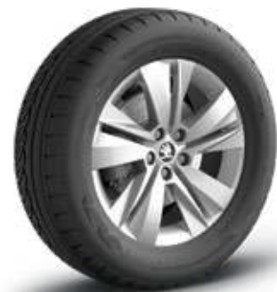
Ambition Alloy Wheels R(16), Grus