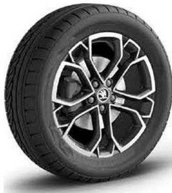
Style Alloy Wheels Dual-tone R(17), Atlas