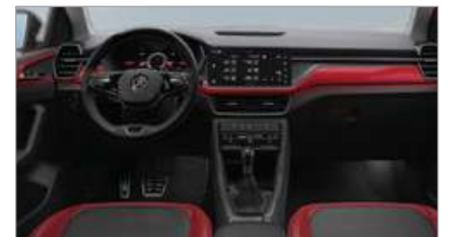
» Red Ambient Lighting with Ruby Red Metallic Décor