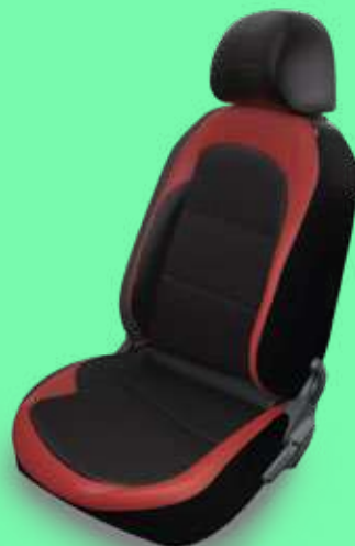
Monte Carlo Inscribed Ventilated Red & Black Front leatherette seats