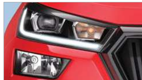
» LED Headlamps with DRLs