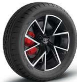
Monte Carlo R17 Dual-tone Vega Alloy Wheels