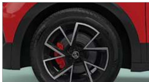
» R17 Dual Tone Alloy Wheels