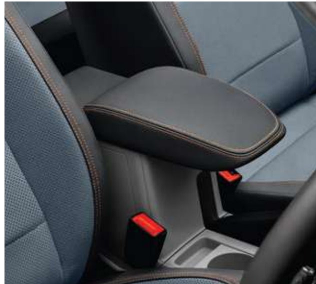
Storage In Front Centre Armrest

Škoda kushaq's extra spacious luggage compartment not only ensures practicality and organization but also empowers your spirit of exploration. The standard rear seats (60:40 folding split) offer a voluminous 385 liters of boot space, complete with 2 fixed hooks and top-tether points. When the journey calls for it, effortlessly fold rear seats via the remote release button for convenience on the go.