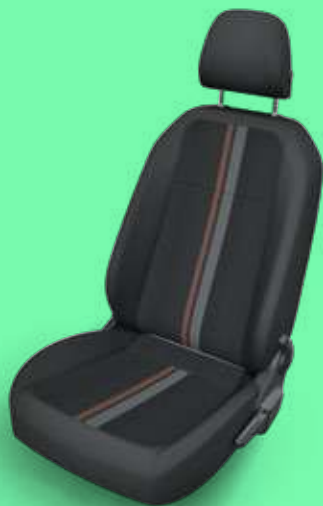
Ambition Black fabric seats with dual colour sporty centre stripes.