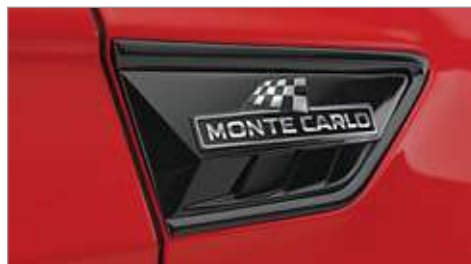
» Exclusive Monte Carlo Badging